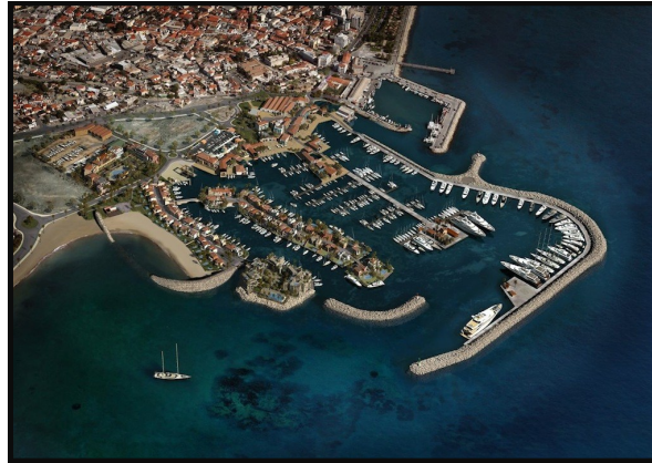
The Limassol Marina!